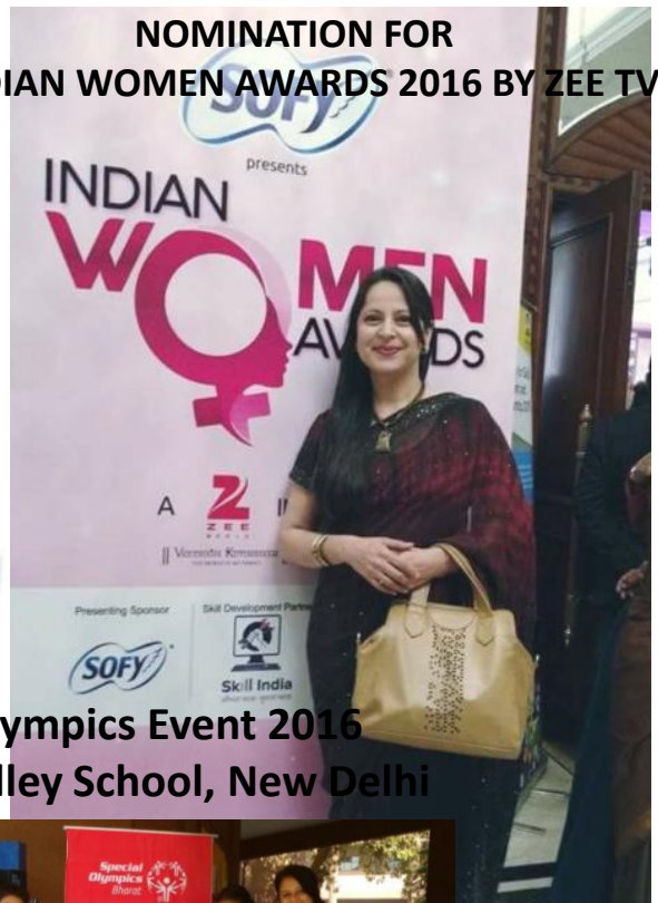
NOMINATION FOR INDIAN WOMEN AWARDS 2016 BY ZEE TV