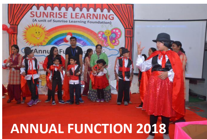
ANNUAL FUNCTION 2018