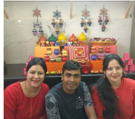
ican Diwali products 2017