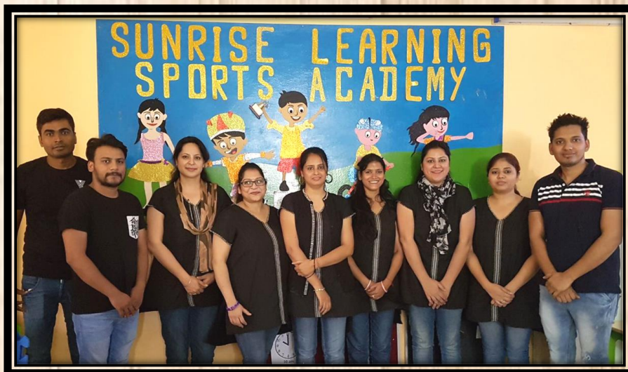
Sunrise Learning Team:

Doctors, Special Educators, Occupational Therapists, Clinical Psychologists, Speech therapists, Vocational Special Educators, Special Sports teachers, Yoga teacher, Art & Dance teachers. Sunrise mothers form the strongest support system.