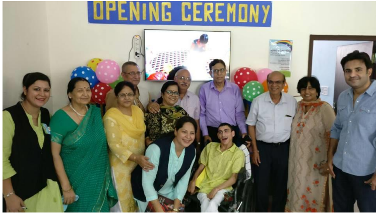
Opening Ceremony of Sports Academy August 2016