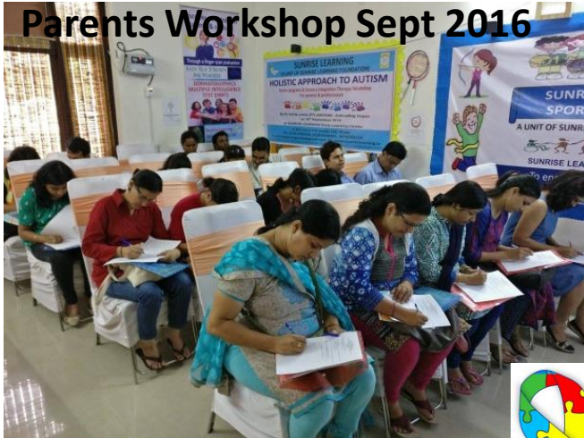
Parents Workshop Sept 2016