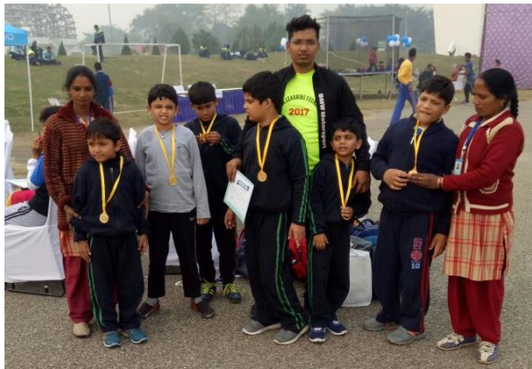
Sunrizers won medals at Cornerstone School Sports Meet 2017 and Art Competition 2017 at Kothari International School