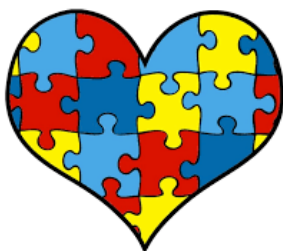
Grandparents Day 2017