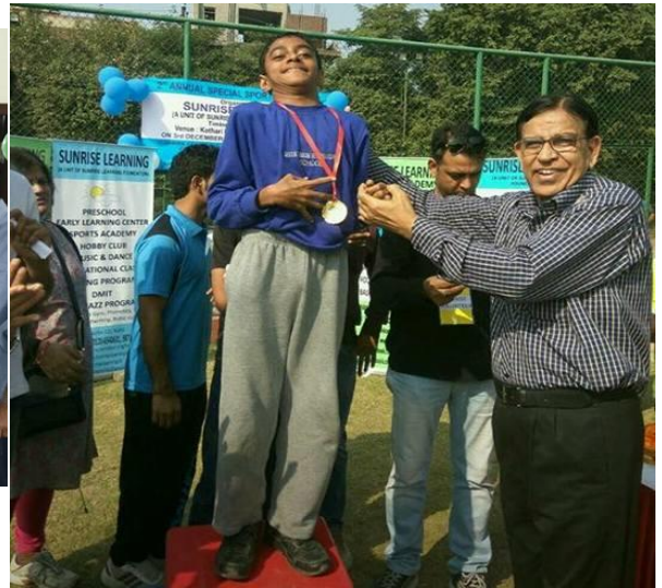
Annual Special Sports Meet 2016