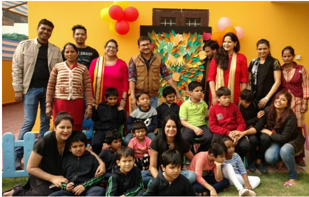
Sunrise Learning 3 rd Birthday 14 th Nov 2017