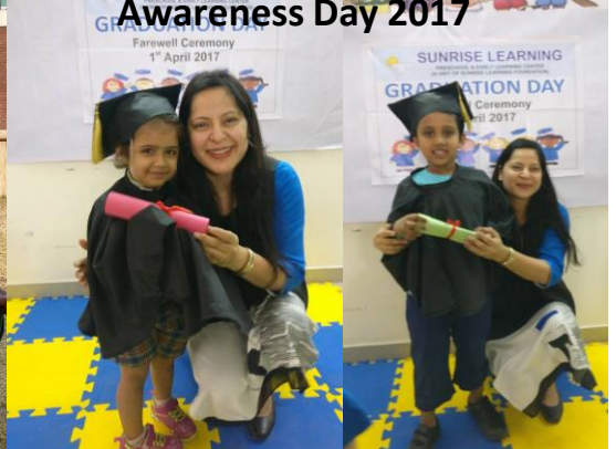
Graduation Day & Autism Awareness Day 2017