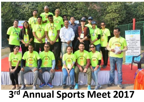
3 rd Annual Sports Meet 2017